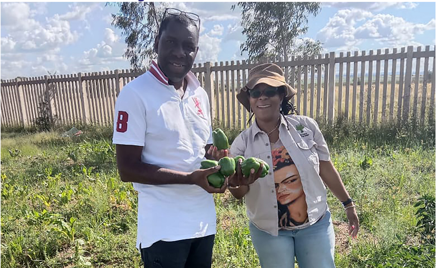
A visit to a poultry and vegetable farmer in Bronkhorstpruit, Pretoria in South Africa.