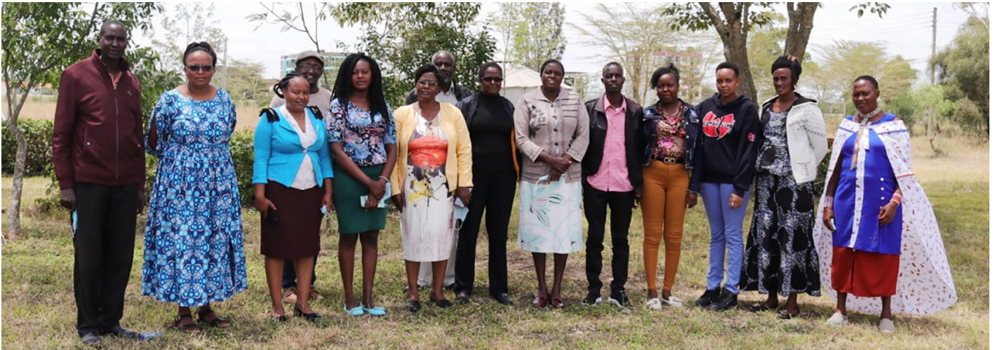
Farmers in Kajiado County in Kenya during one of the stakeholder engagement events.