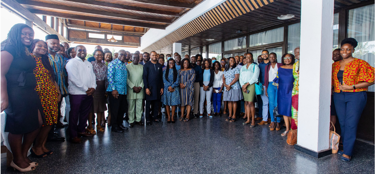
Participants at the discovery roundtable event on research and innovation support in Ghana.